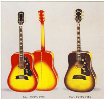
No. 665 CS