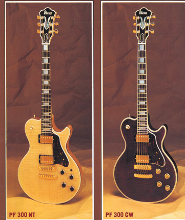
PF 300 NT