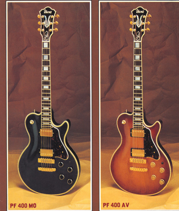
PF 400 MO