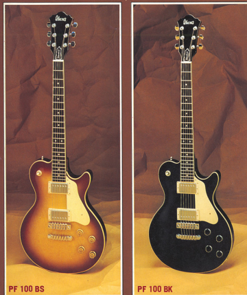
PF 100 BS