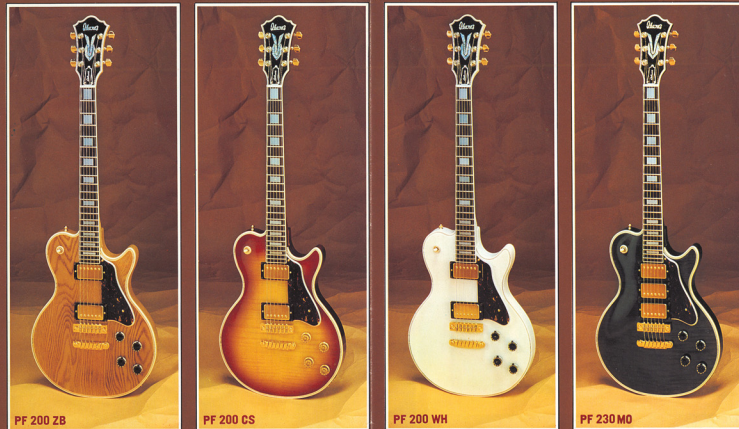
PF 200 ZB