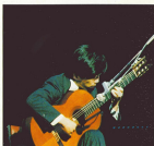
Model No.314 & No.314NM