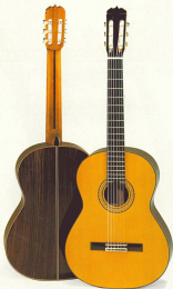
Model No.2862 Andorra Pro.

The series of Ibanez covers whatever desires you will have on the quality guitar purchase, the teachers, semi-professionals, and very professionals on stage.