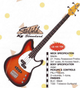
CB 202 TS

STARFIELD Standard NECK SPECIFICATION Maple 21 frets, Rosewood Fretboard. Set neck, All Access Neck Joint. BODY SPECIFICATION Alder PICKUPS & CONTROLS PBJ Pickups 2-volumes, 1-tone. FINISHES BLK: Black TSB: Tobacco Sunburst