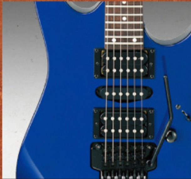
JB (Jewel Blue)