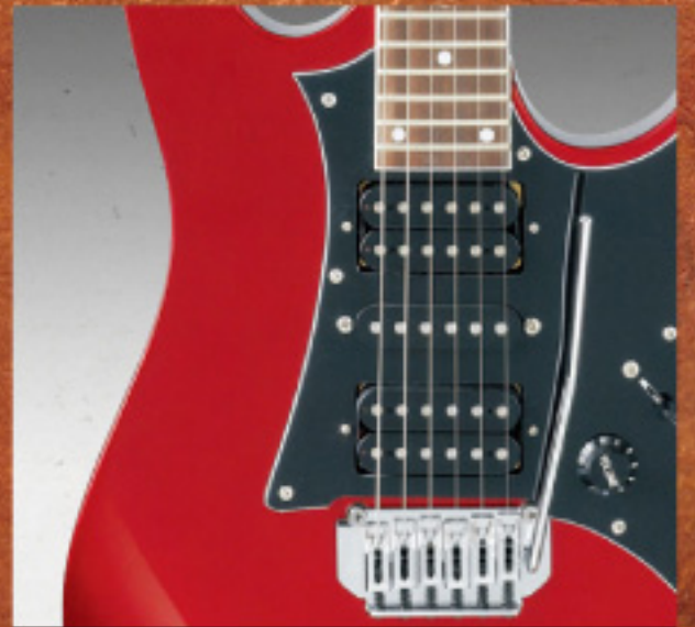
CA (Candy Apple)