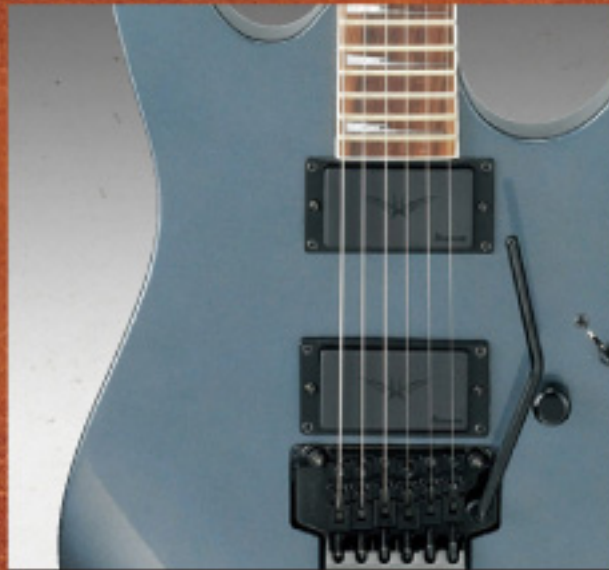
NM (Navy Metallic)