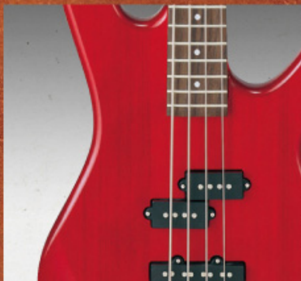
TR (Transparent Red)