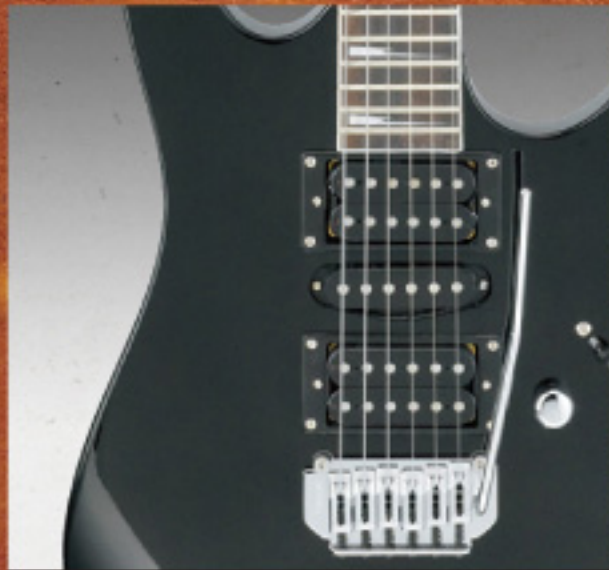
BKN (Black Night)