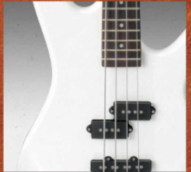
PW (Pearl White)