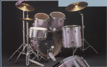
Cymbals not included

and steel-sensitive snappy snares. They are now all available in Granstar Snare AW336C with covering afford additional sound control and make drum extremely durable and roadworthy.