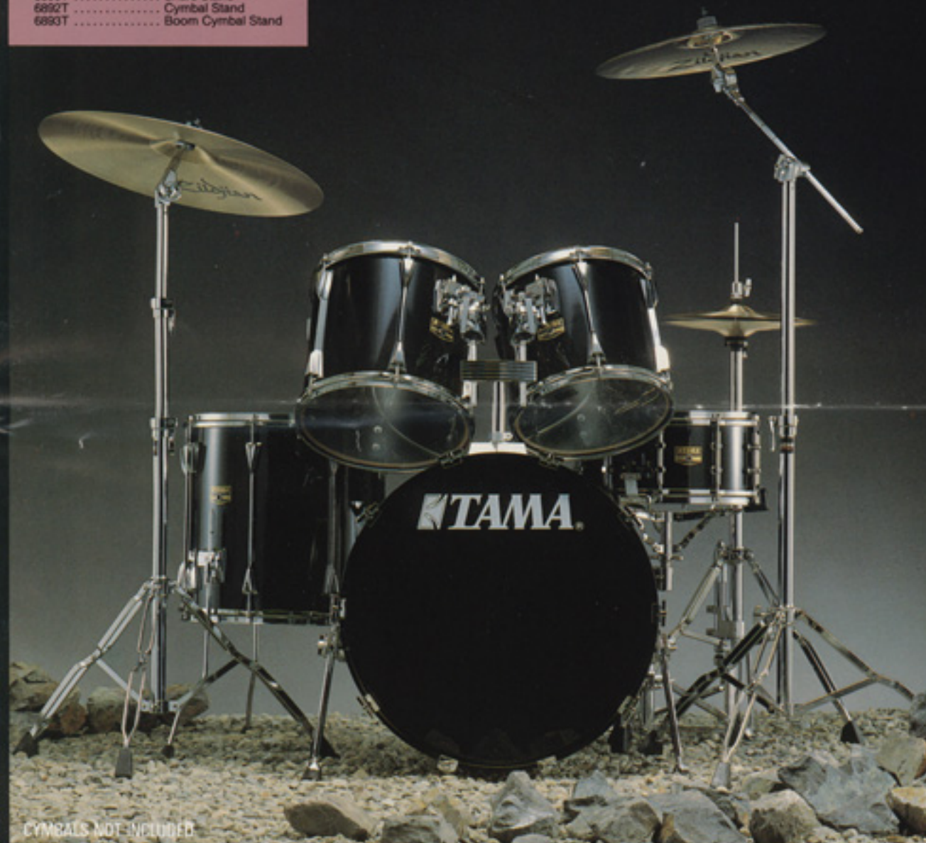
CYMBALS NOT INCLUDED