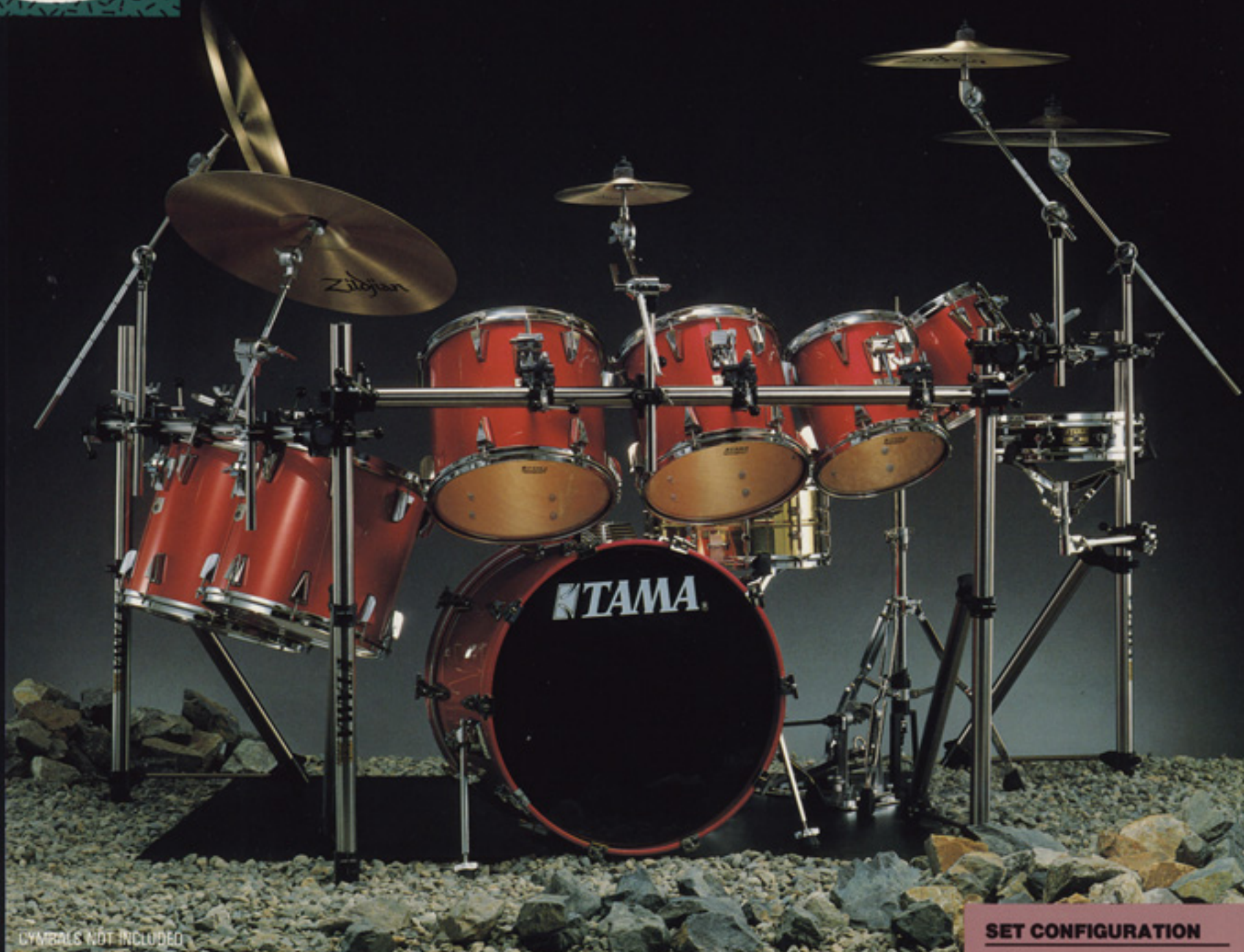
CYMBALS NOT INCLUDED