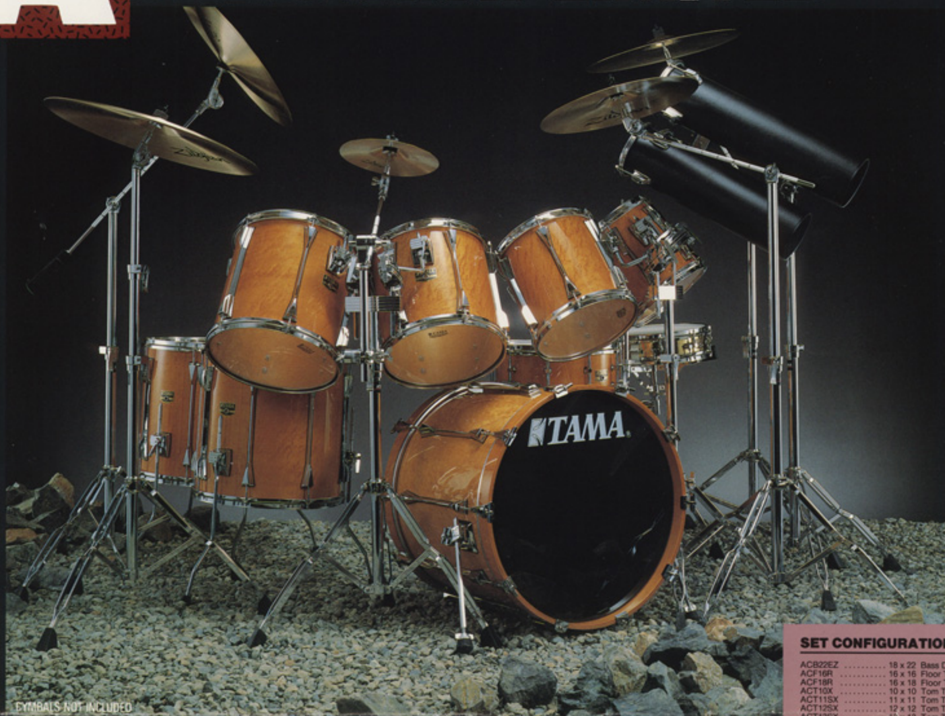
CYMBALS NOT INCLUDED