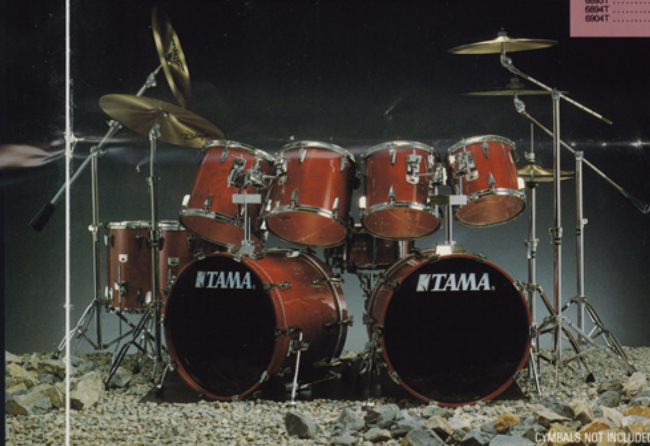
CYMBALS NOT INCLUDED